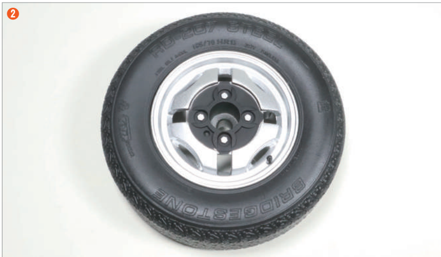
30-B Outer Rim fitted into the 30-A Tyre.

By temporarily fitting the protrusions of the 30-E Rim Cap into the holes in the 30-B Outer Rim , you can check the orientation of the "TOYOTA" logo on 30-E . You may adjust the position of the logo on the 30-A Tyre to your preference to match this angle. If the temporarily fitted 30-E is difficult to remove, gently push it from the reverse side using a toothpick or similar tool.